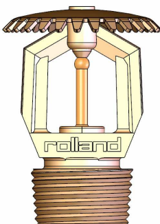
SSU Rapide 3/4